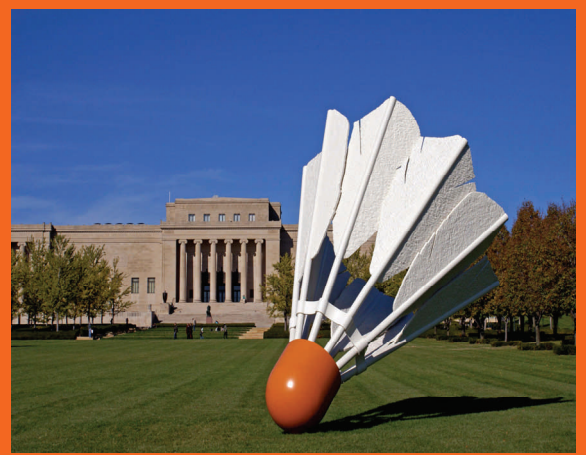
Shuttlecock Nelson Atkins Museum of Art Kansas City