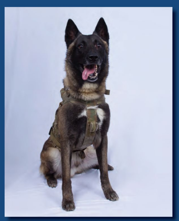
I think we can all agree that no matter what sex he was assigned at birth, Conan is "A Very Good Boy."